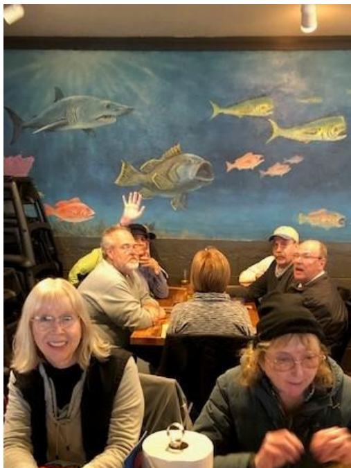
Photos from Fin's

or in the lee of Padre or Mustang island. I will select the exact location a few days in advance depending on the wind forecast. Watch member blasts for more details.