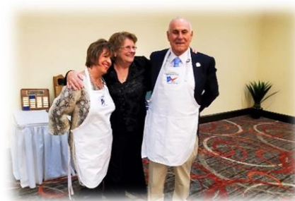
Cooks of the Year