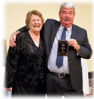
2021 Racer of the Year