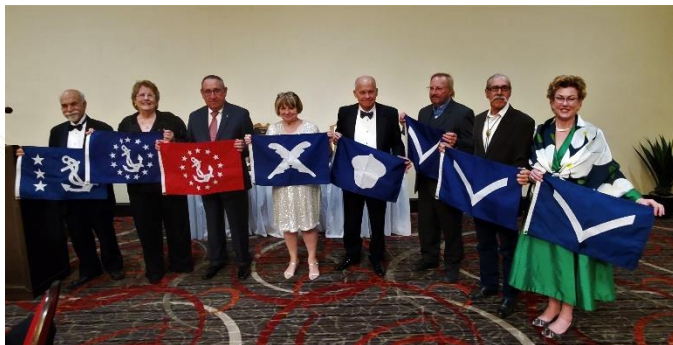
2023 Board of Directors